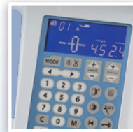
Large LCD Panel