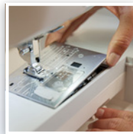
One Step Needle Plate