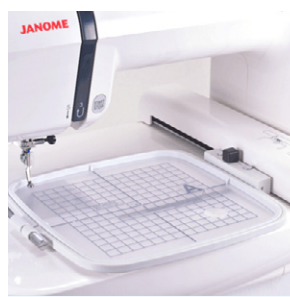
MAXIMUM EMBROIDERY SIZE: 5.5 X 5.5"