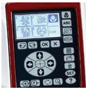
73 DESIGNS AND 3 MONOGRAMMING FONTS