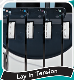
Lay In Tension