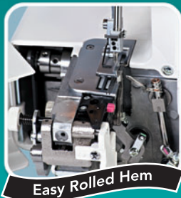
Easy Rolled Hem